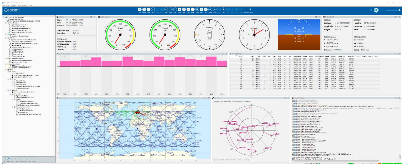
Figure 2: Spirent's SimGEN

SimXona features and capabilities are controlled by Spirent's SimGEN, the world's leading GNSS simulation software for test scenario definition, execution, data management and GNSS RF constellation simulator command and control. With the fullest capability, features and performance continuously developed in close consultation with GNSS system authorities over the last 35 years, SimGEN supports all the GNSS test parameters and control capabilities needed for comprehensive GNSS testing for research, development, and design of GNSS systems, services, and devices across any application.